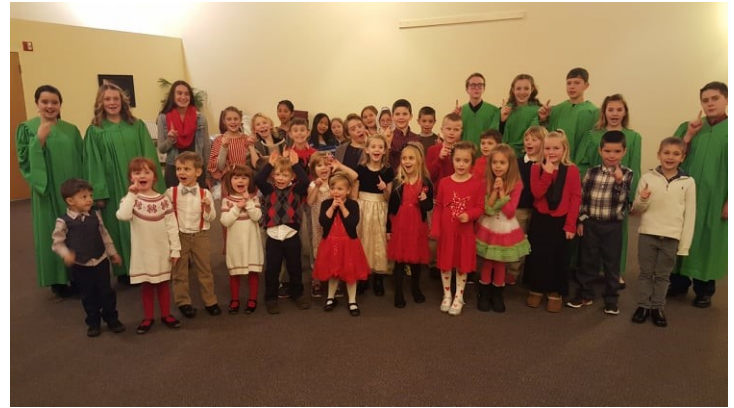
Ready for worship in 2018!