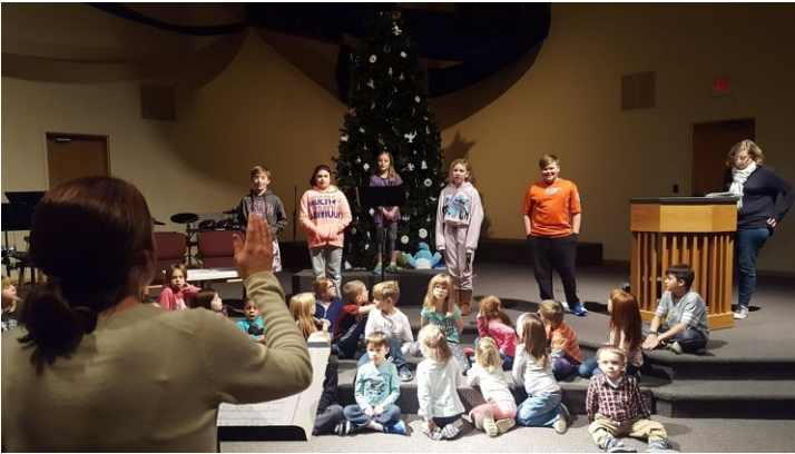
Rehearsing for Christmas Eve 2019